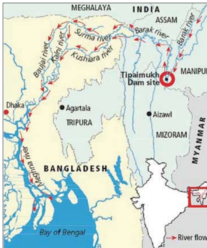
The dam site

Tipaimukh was not conceived and designed for the people of Manipur, or for that matter for the people of India's northeast region. It was initially designed to control floods in lower Assam, and then to generate electricity for the Indian state-owned utility NEEPCO for sale outside the region. For all these years the dam builders have not informed or consulted the people, especially those who will be directly impacted. The dam is not based on local requirements, but is imposed from above, to serve unknown economic interests. An issue of consent is a must when they want to bring in a project of such magnitude that will submerge villages, fertile agricultural land, forests, and not even meet local needs. Local organizations have also proposed alternatives, including smaller, less destructive dams.