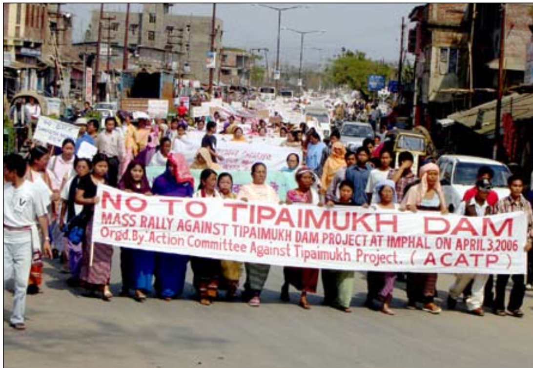
Villagers protest Tipaimukh Dam in 2008.

The author is chairman of Citizens Concerned for Dams and Development, in Manipur, India.