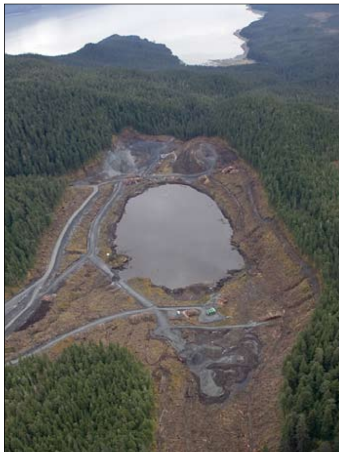
The US Government recently gave a mining company permission to fill Lower Slate Lake with chemically processed tailings from the mine. This photo shows the lake after work on the mine began.

The precedent-setting case began with changes to environmental protection laws set in place by George W. Bush's administration. In 2002, the administration expanded the definition of "fill material," which is regulated by a less strict provision in