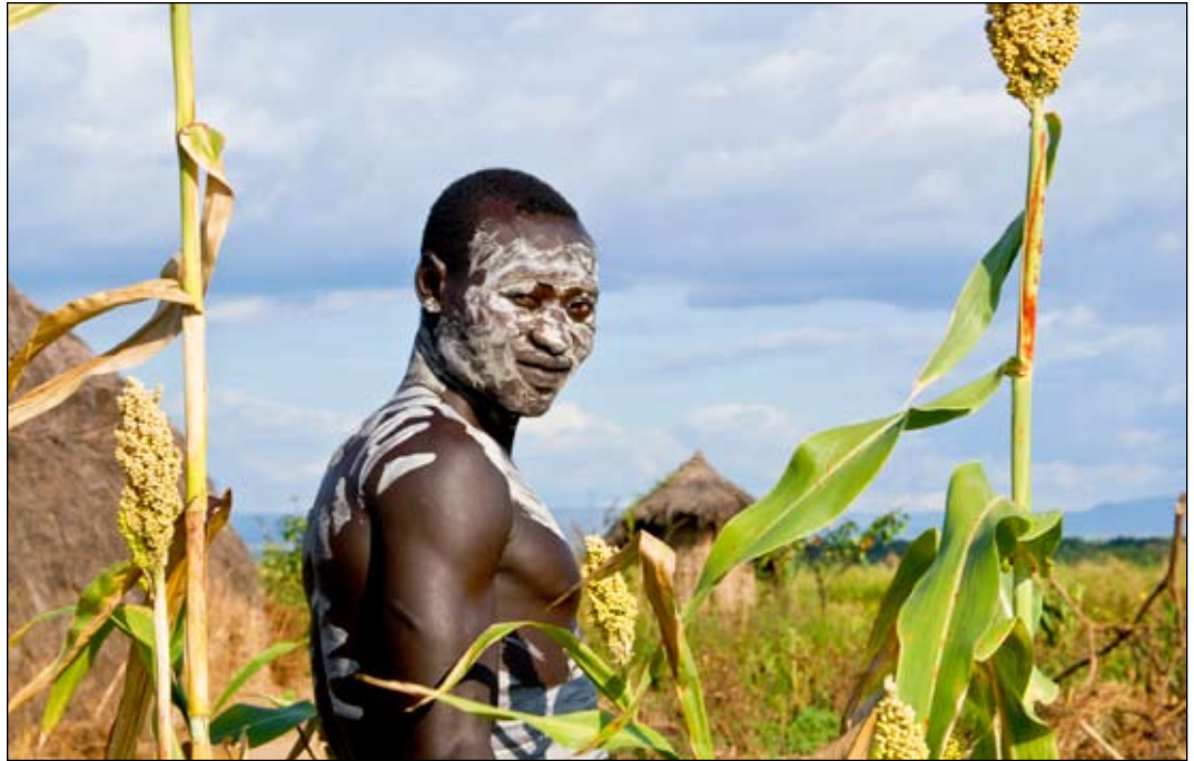
Farmer in his fields, Lower Omo Valley. Some 200,000 pastoralists who call the Lower Omo home could be harmed by changes to the river from Gibe 3 Dam.

The natural flood cycle of the Omo River, which is central to the downstream region's economy and food security, would be fundamentally disrupted by the dam. Filling the reservoir would dramatically reduce water levels in Kenya's Lake Turkana, the world's largest desert lake, stressing its fragile ecosystem to the brink of