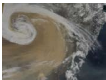
Bakun reservoir clearing added smoke pollution to this year's "brown cloud" over Asia.

Developers of Malaysia's Bakun Dam have begun burning forest and debris to clear the proposed reservoir area, according to the Sarawak Conservation Action Network (SCANE). The actions come at a time when the country's atmosphere is