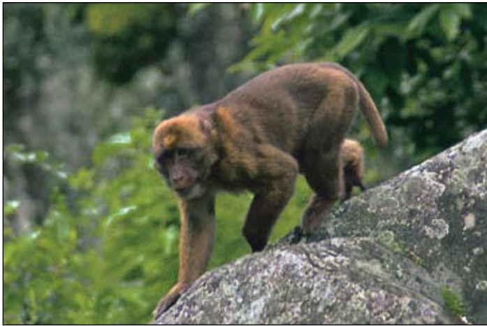
Local people call this the “monkey of the deep forest.” Biologists call it rare, and threatened by a planned dam boom in the Himalayas and other serious threats.