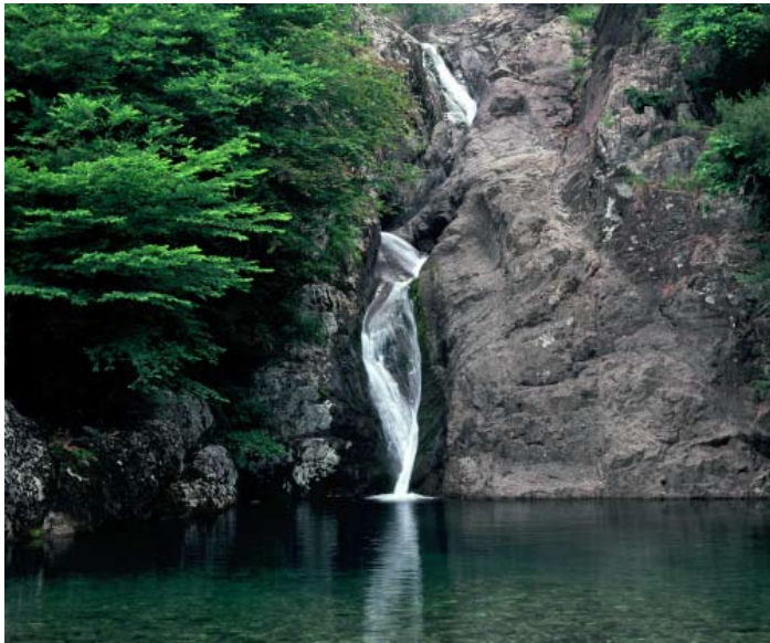
The Yeongsan River is one of the four rivers that would be dammed under a government "river restoration" plan.

The author is co-chair of International Rivers' Board of Directors, and Associate Professor of Landscape Architecture and Environmental Planning at the University of California, Berkeley.