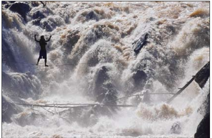
A daring fisherman crosses Khone Falls.

The Don Sahong Dam, a hydropower project whose electricity would primarily be for export, is being developed by Malaysian company Mega First Corporation Berhad. The project was expected to give notification to the Mekong River Commission earlier this year, signaling the Lao government's intention to move forward with the dam, but has been delayed due to a lack of a market for its