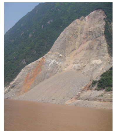
Landslide at the Three Gorges Reservoir

The Three Gorges Project is also creating seismic risks. It sits on two major fault lines, and hundreds of small tremors have been recorded since the reservoir began filling in 2006. Reservoirs have triggered scores of earthquakes around the world, and there is evidence that the devastating Chinese earthquake of May 2008 was caused by the Zipingpu Dam. While dams are built to withstand strong earthquakes, the houses, schools and office buildings of millions of people in their vicinity are not.