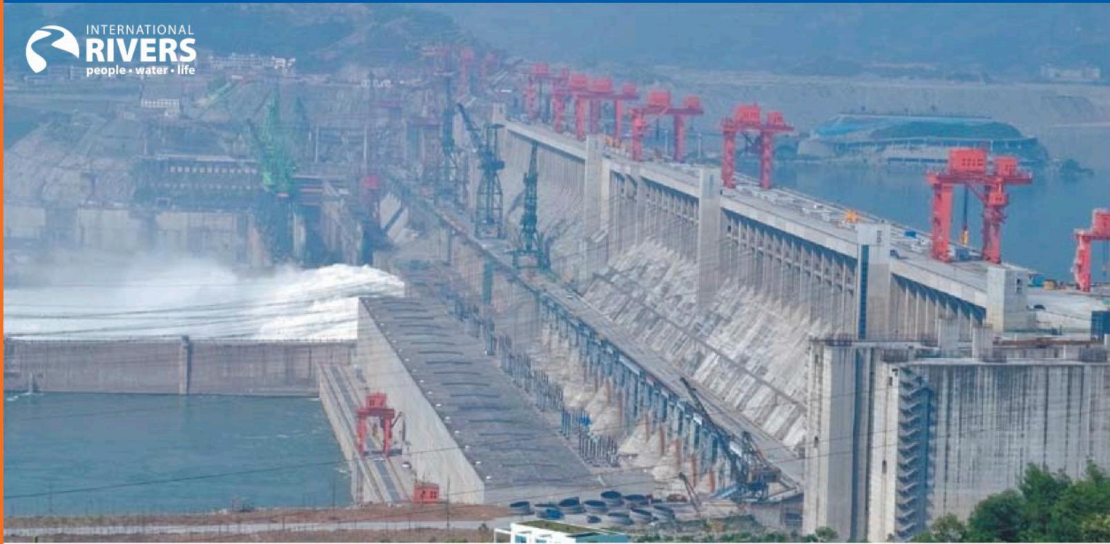
Three Gorges Dam nears completion