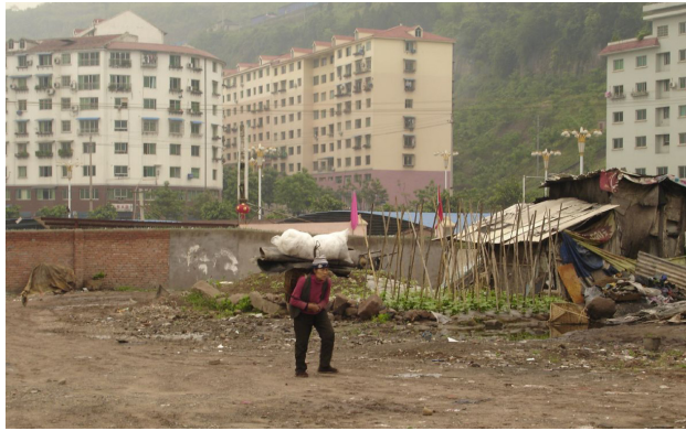
The town of Yunyang, already desperate and poor (Nick Austin)

On a visit to the reservoir area in summer 2009, affected people routinely complained that the compensation they received for their old houses was not sufficient to pay for their new homes. Some cities such as New Fengdu have overcome the shock of resettlement and restarted their economy. Others look decrepit a few years after they were built. In Yunyang, only 45 of the city's 181 factories were moved to higher ground, and many of them have closed in the meantime. An estimated 20,000 people have lost their jobs. Many people had to spend their savings to pay for their new homes and could not invest in a new future.