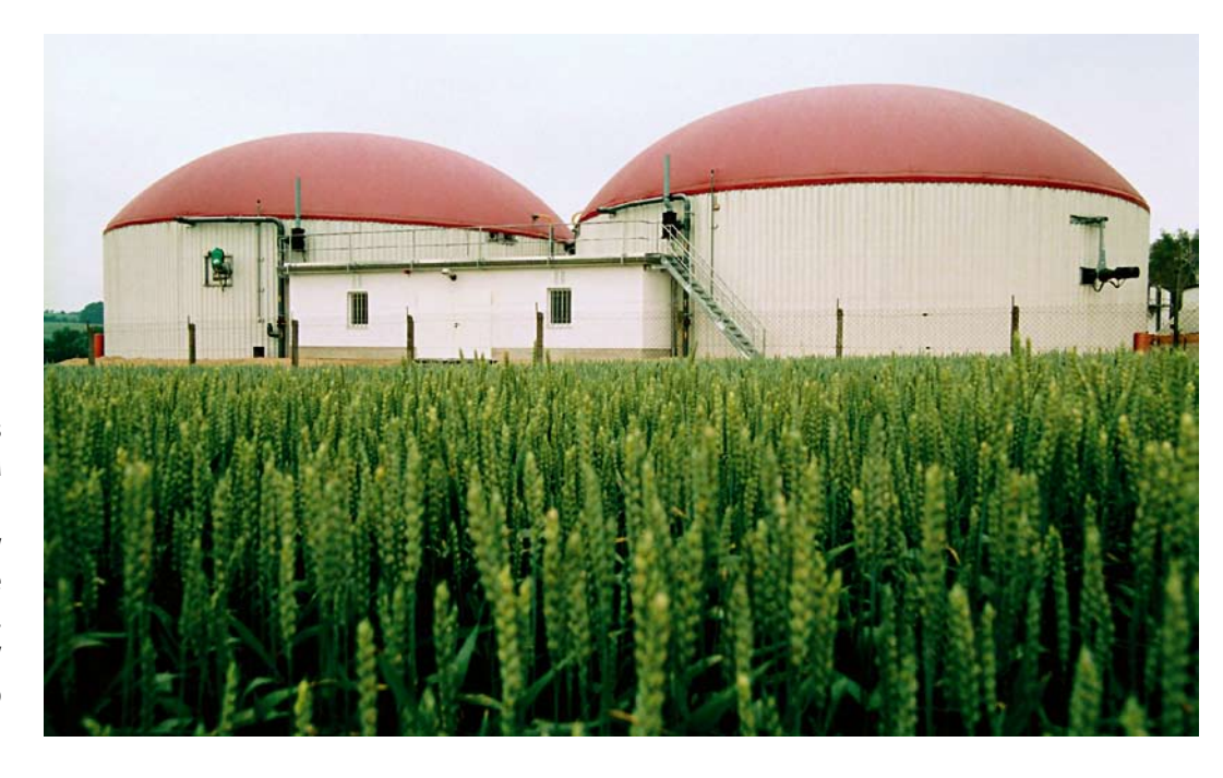
323 CDM Biogas Projects are in the current CDM pipeline, 143 of which have been registered by the CDM Executive Board so far.

shift to fossil fuels once the available biomass has been exhausted. This baseline would yield less CERs than a baseline based on the reduction of deforestation, though.