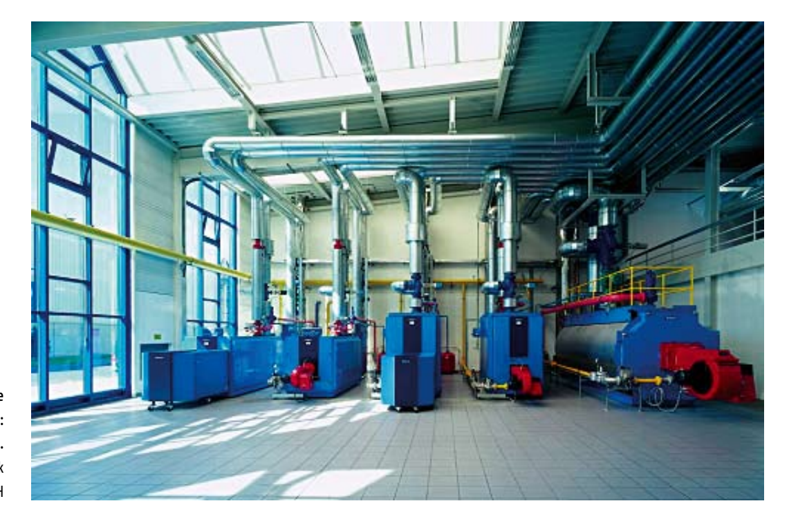
Energy efficiency is at the heart of JIM. NRW concept: a modernised heat station.

companies, verification of minimal carbon savings is unviable due to the high level of effort and the associated transaction costs. The long payback periods for measures with minimal carbon savings prevent small and mediumsized businesses from implementing such projects. Germany plans to allow a number of similar activities to be conducted as JI projects in industry and private households.