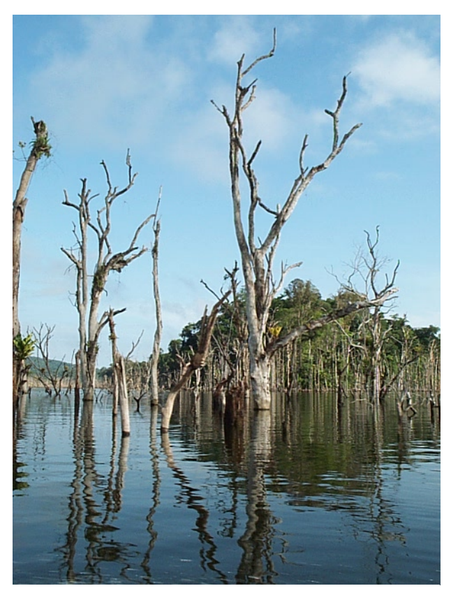
Figure 1: Dead trees in the Petit Saut reservoir, French Guiana

This briefing report highlights some of the key research and guidelines on calculating reservoir emissions from specific and regional projects. It starts with an assessment of how key institutions measure greenhouse gases, then looks at key advancements in research since 2007,<sup>2</sup> and concludes with an assessment of areas where further research is necessary. We provide this briefing to NGOs, academics, governments, civil society members, and anyone interested in understanding where reservoir emissions research currently stands, and when/where it is necessary to include reservoir emissions in national greenhouse gas inventories.